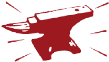
BidForge: Manage Bids & Vendors